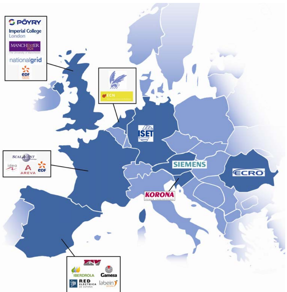
Figure 2: Overview of the consortium